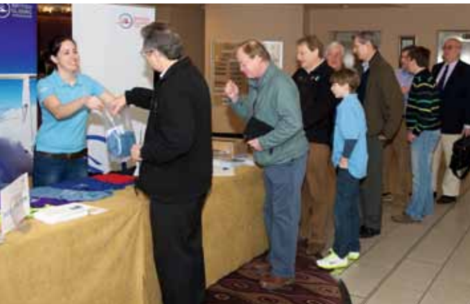
Delegates signed in and collected their free polo shirts, courtesy of sponsors Joint Aviation Services