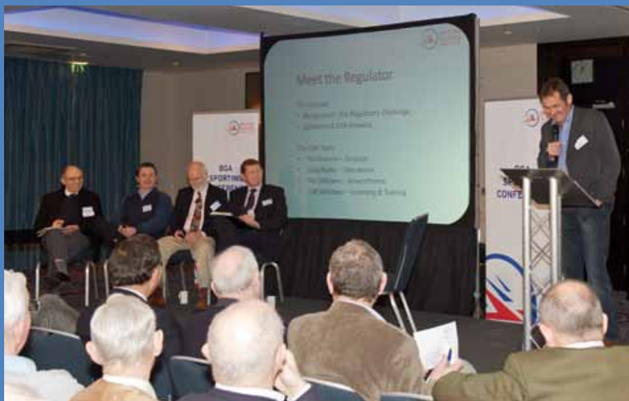
There was the opportunity to get up close and personal with senior members of the CAA