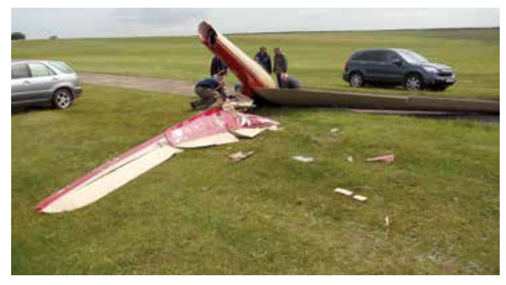
Flight with unconnected elevator

Shortcomings in preparing a glider for flight can be lethal. In many recent publications the BGA has advised that rigging, DIs, and pre-flight checks must be carried out meticulously and without interruption or distraction.